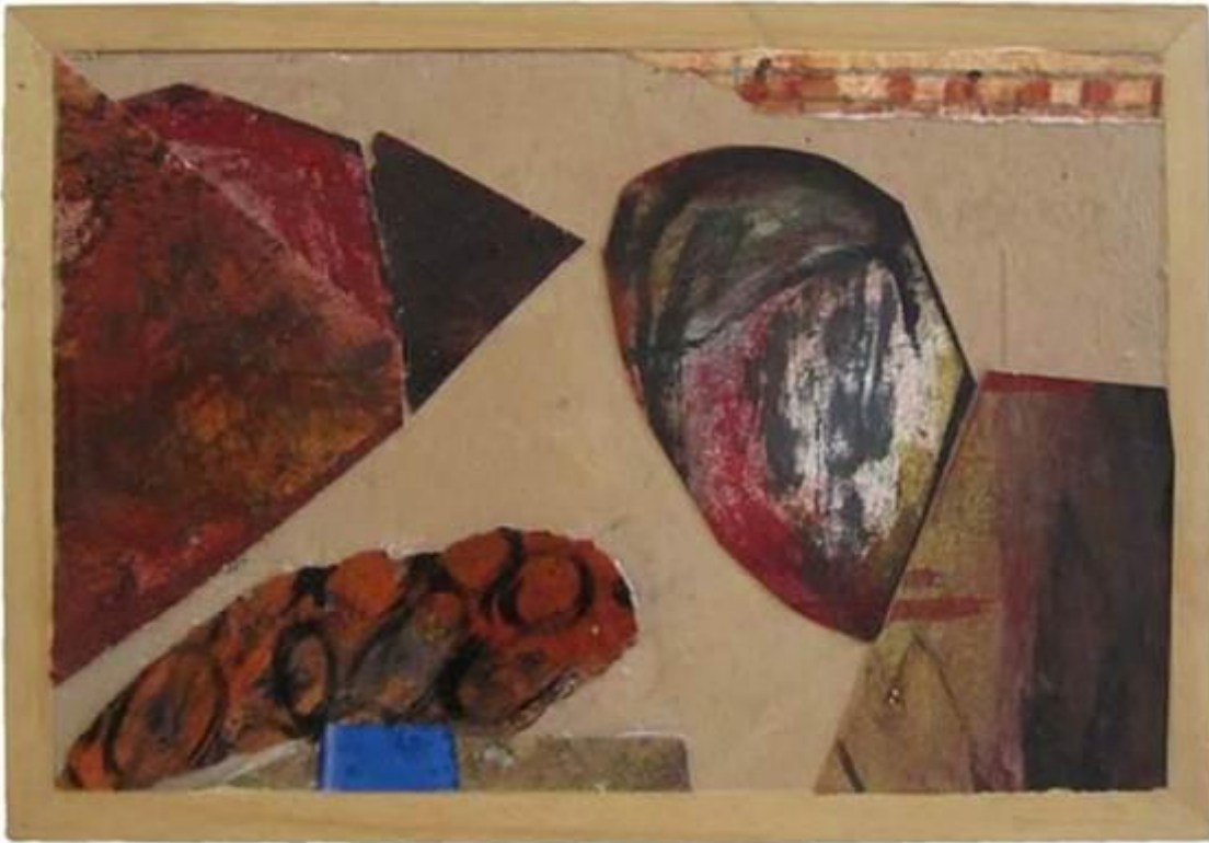
Mixed media collage by Fay Grajower