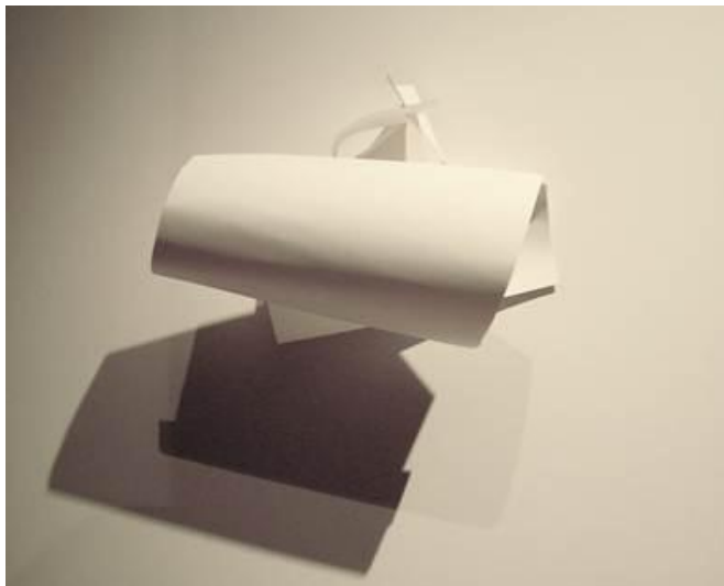
Malcolm Mooney, The Sun Curled around the Sunset , Paper, Installation detail