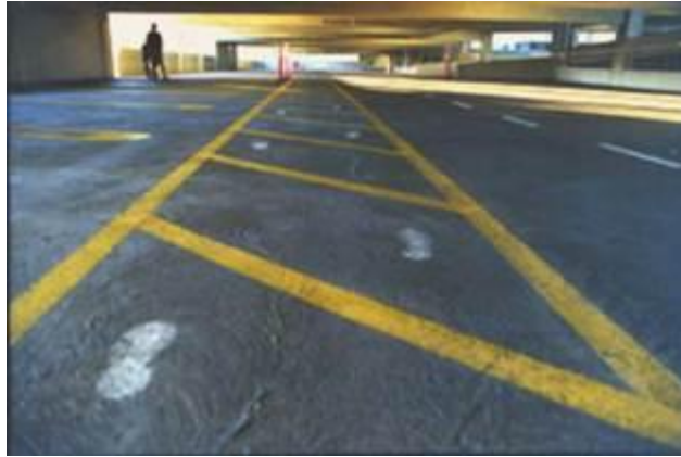
Thomas Agasid Untitled